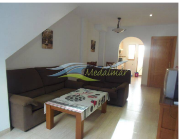
Apartment for sale with 2 bedrooms in Palomares, Almería.

This beautiful ground floor apartment is located in the residential Balcones del Marqués I, very quiet and with excellent construction qualities.