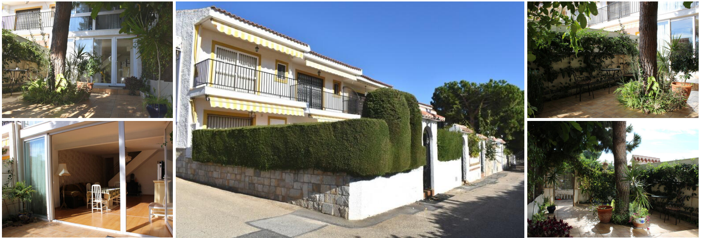
Beautiful Beachside Townhouse La Zenia Beach!!!

Modern Spanish townhouse set just a few hundred yards from the beautiful sandy beach of La Zenia.