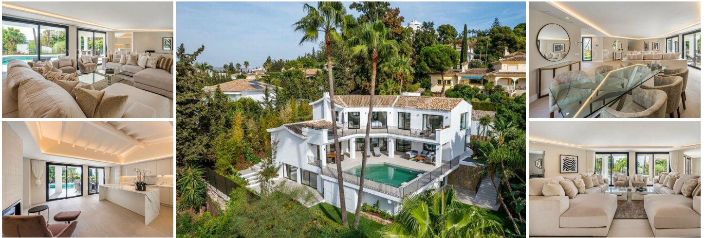
Villa for sale in El Paraiso, Estepona

Constructed in 2022, this high-quality home is offered for sale in the exclusive, quiet and highly sought-after area of El Paraiso on the vivid New Golden Mile of Estepona. Surrounded with similar high-end properties of the prestigious area, it is located close to all amenities and services, beaches including the Blue-flagged awarded, several 5-star hotels, SPAs, tennis clubs and golf courses, shops and international schools, restaurants, bars and chiringuitos, and all adventures and chic of famous Puerto Banus.