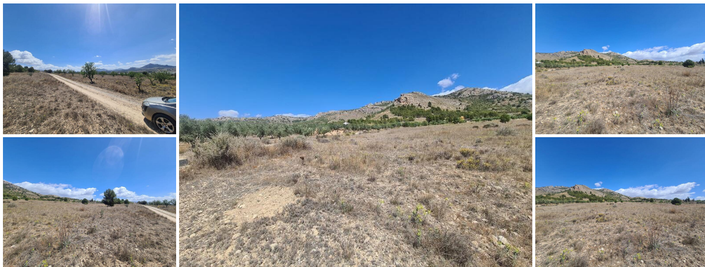
16,200m 2 of land in Sax - Santa Eulalia. Awaiting photos

We are proud to offer this plot of land with good access to the motorway system, but with great mountain views. Water and electricity is close, but not on the land, so the buyer would be responsible for these, or, would be ideal for an off grid property. There is a petrol station with shop, and two very good restaurants withing walking distance.