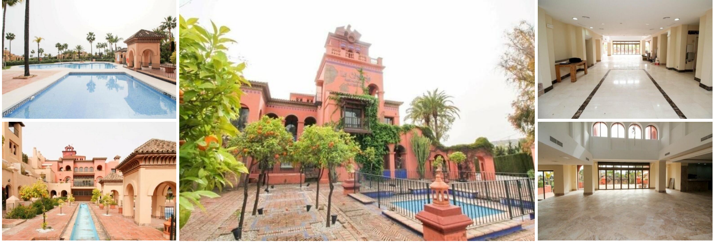
Boutique Hotel / Restaurant in La Cartuja del Golf, Atalaya.

The property originally built in 1999 is available freehold and consists of Large marbled entrance lobby with high ceilings, Restaurant area with feature fireplace and terrace for 10 tables, industrial kitchen and 14 Suites with kitchen and bathrooms, all with large terraces with golf or pool views.