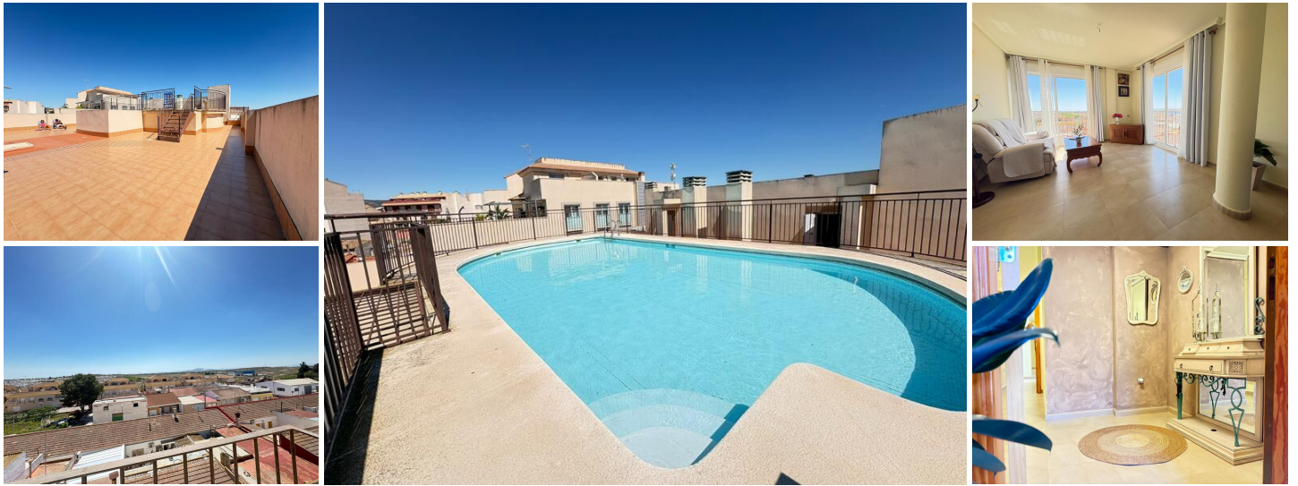
Charming 2-bedroom apartment for sale in Sucina with terrace and pool access

Discover this bright and well-located apartment for sale in Sucina, offering comfort, convenience, and excellent value in one of Murcia's most popular villages. This property features 2 bedrooms, 1 bathroom, a spacious living-dining area, and a large private terrace ideal for enjoying the Mediterranean lifestyle.