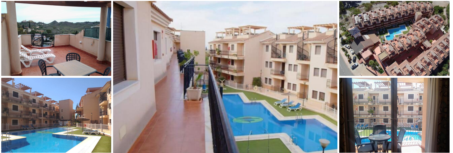
Tourist Apartments for Investment Near the Beach in Aguilas-Murcia