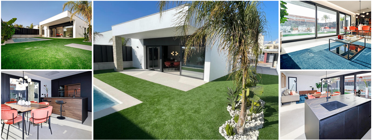
Charming single-story villa with 3 bedrooms and private pool

Upon entering, you are greeted by a spacious, light-filled open-plan living and dining area that flows seamlessly into a modern, fully equipped kitchen. The home offers three bedrooms, including two generously sized at 10 m 2 and a master bedroom with an en suite bathroom. In total, there are two full bathrooms and a dedicated laundry room, providing functionality and comfort.