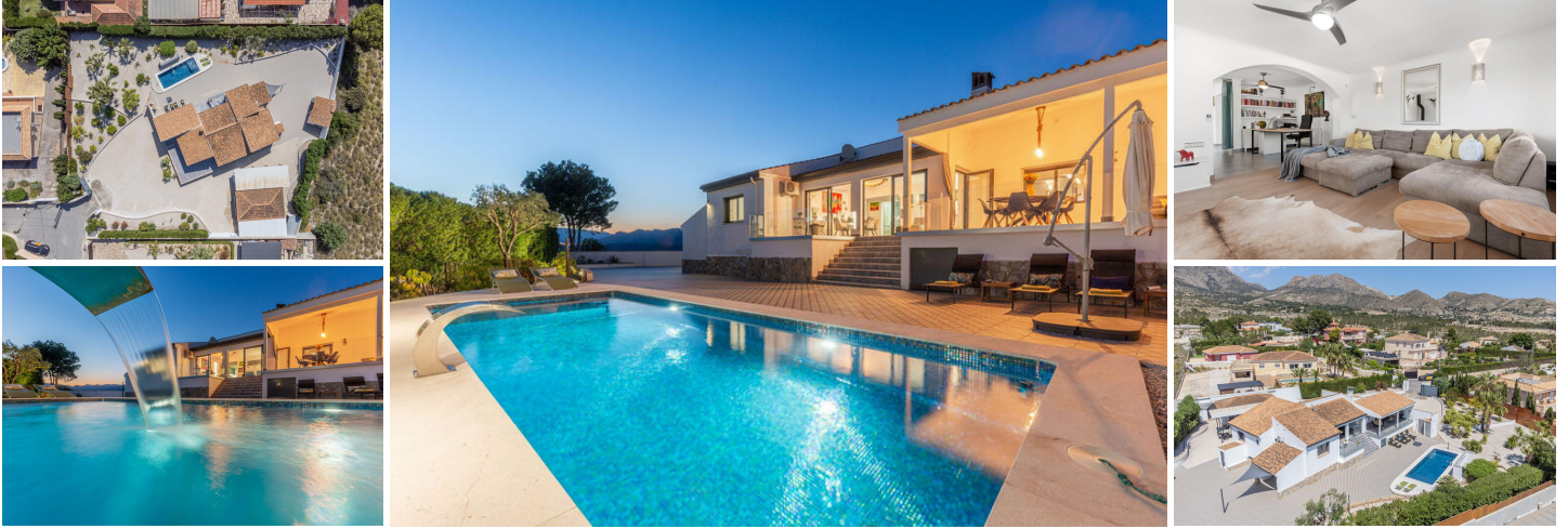
Villa Mirador del Sol – A Private Retreat with Coastal Views in Pla Lloma, Busot

Set in the highly desirable Pla Lloma area near the charming village of Busot, Villa Mirador del Sol is a beautifully refurbished residence that offers the perfect blend of privacy, elegance, and Mediterranean living. With over 250 m 2 of interior space and nestled on a plot more than eight times its footprint (2046m 2 ), this exceptional home provides a rare opportunity to enjoy tranquil surroundings just a short distance from the coast.