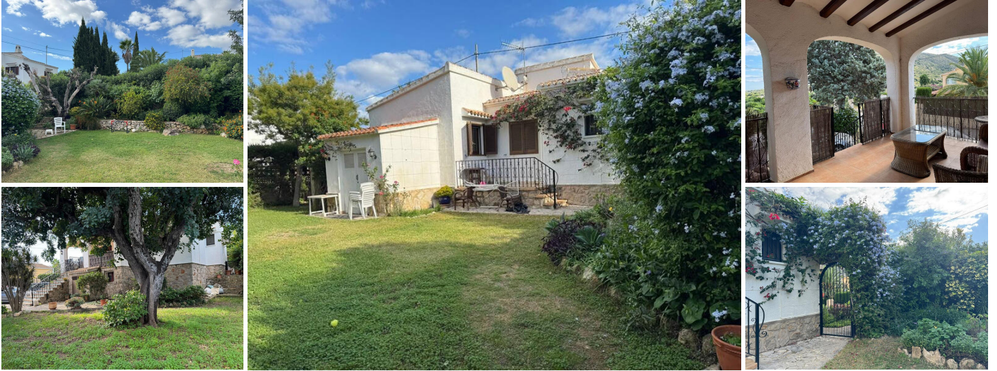
Charming Countryside Villa with Mountain Views – La Xara, Dénia

Discover this hidden gem nestled in the peaceful countryside of La Xara, offering spectacular mountain views and a true sense of privacy while remaining close to all amenities.