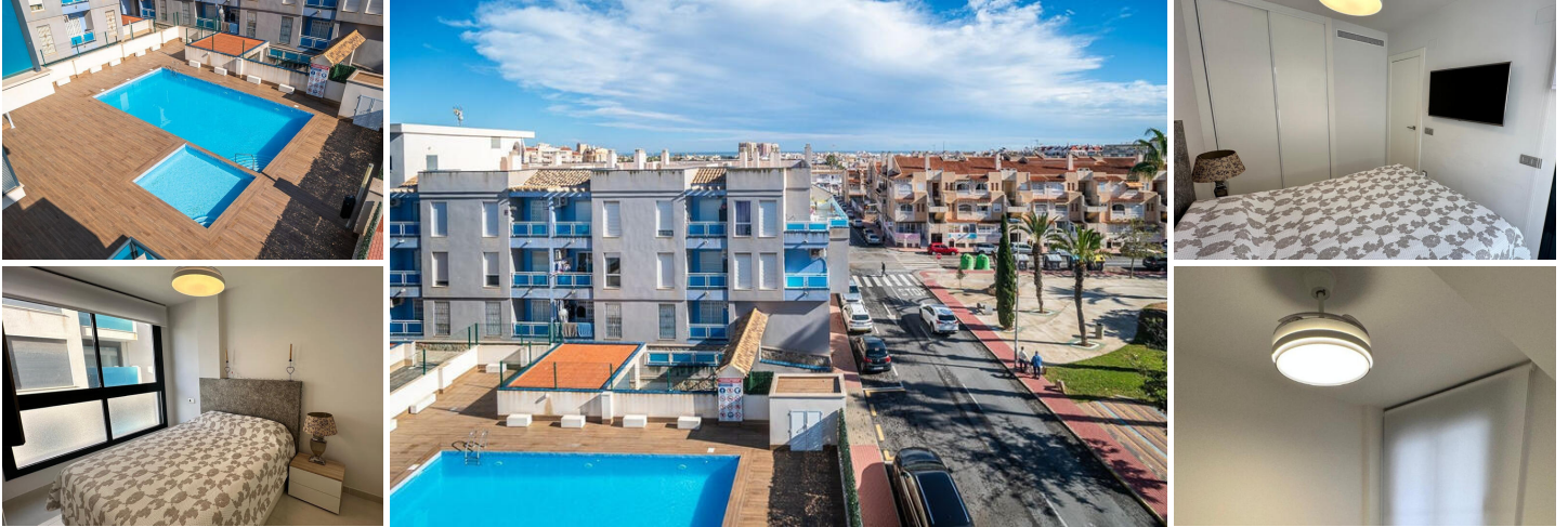
Modern 2-Bedroom Apartment with Terrace

This stylish 2-bedroom, 1-bathroom apartment is in excellent condition and is part of a modern building completed in 2022.