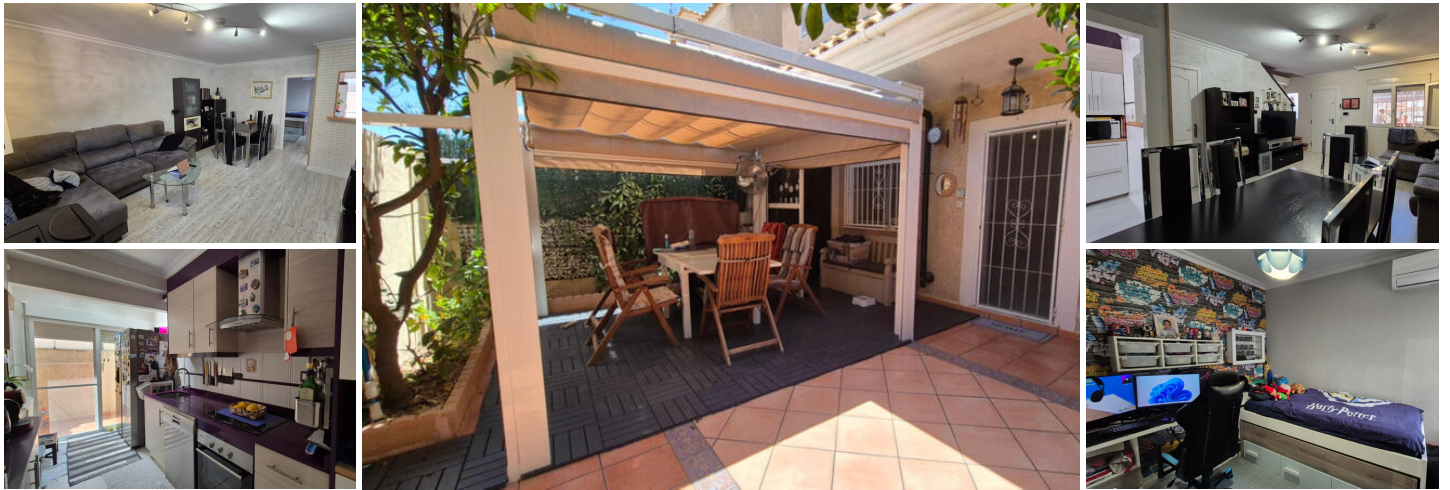
Beautiful 3-Bedroom Home in Aguas Nuevas, Torrevieja – Lake Views & Prime Location

Nestled in the sought-after area of Aguas Nuevas, Torrevieja, this well-maintained property offers the perfect blend of comfort, convenience, and Mediterranean charm. Boasting 3 spacious bedrooms and 2 modern bathrooms, this lovely home is ideal for both permanent living and holiday escapes.