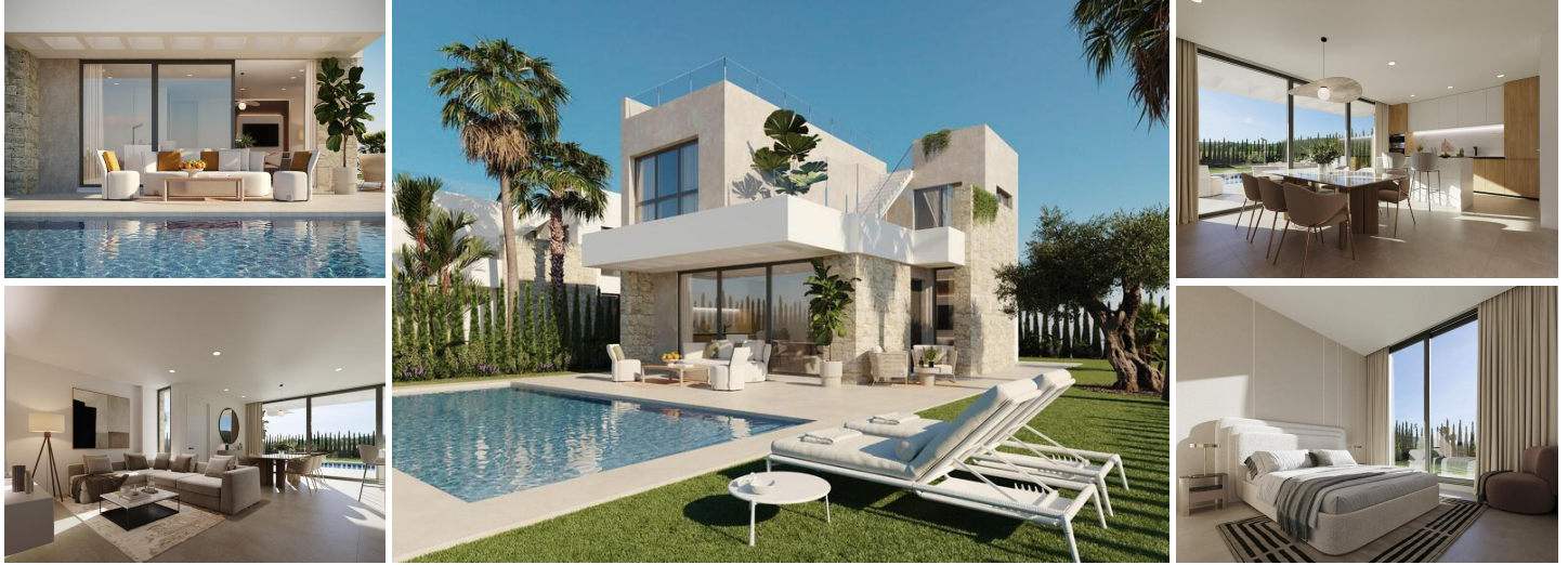
Modern New Build Villas with Sea Views in Finestrat, Alicante