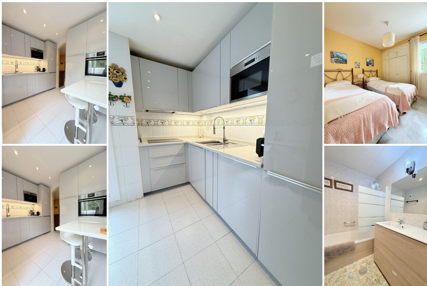
Casa Sol – Garden Apartment in El Paraíso

Casa Sol is a beautiful 2-bedroom, 2-bathroom garden apartment ideally located in the sought-after area of El Paraíso, within walking distance to local amenities, including tennis and golf facilities, the beach, bars, shops, and restaurants.