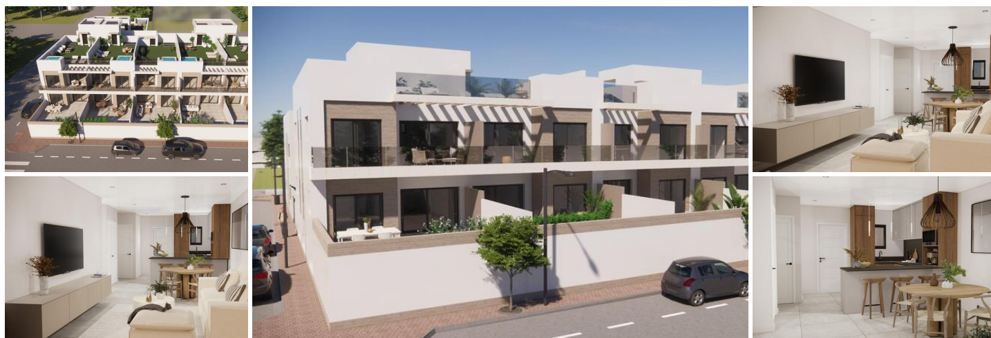
New Build Apartments in Rojales Close to Golf and Beaches