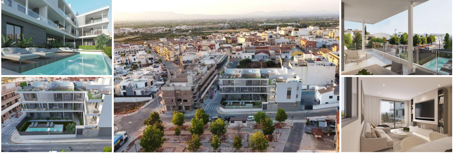
New Build Apartments in Benijofar with a central location