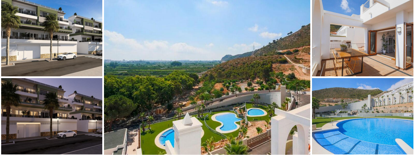
New Build Apartments with Sea Views in Xeresa Costa Blanca North