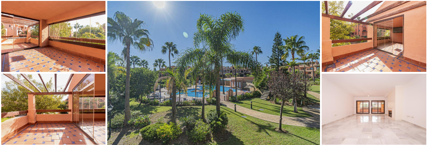
Prime Beachside Apartment in Estepona East

Discover a rare opportunity to own a large, middle-floor apartment in one of Estepona East's most sought-after second-line beach developments: the exclusive Hacienda del Sol. Perfectly positioned just steps from the beach, this residence is surrounded by the full spectrum of local amenities—supermarkets, schools, restaurants, and more—while also offering quick access to several of the area's top golf courses, the Guadalmina Commercial Centre, San Pedro de Alcántara, and the world-famous Puerto Banús.