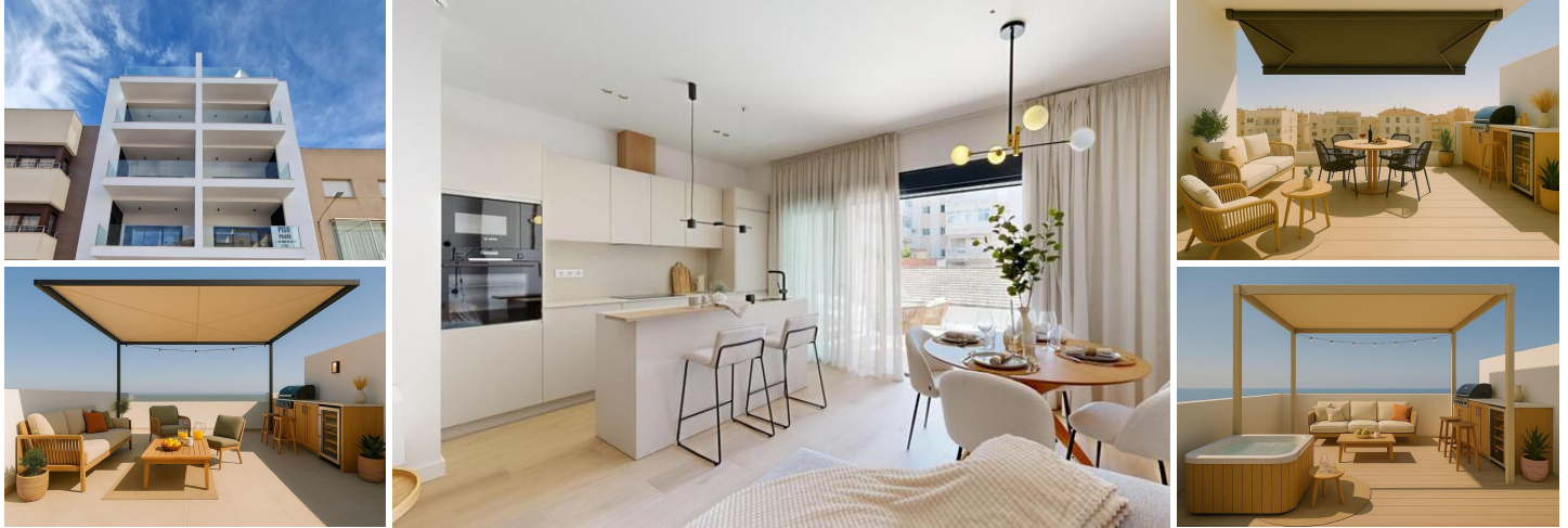
New Build Penthouses in Guardamar del Segura with Private Solarium