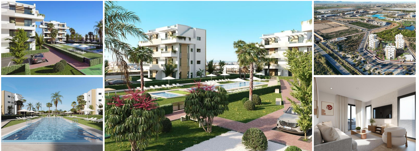
New Build Tourist Apartments in Santa Rosalía Lake and Life Resort Costa Cálida