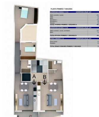
Planta Primera y segunda. Estudio B y Vivienda A