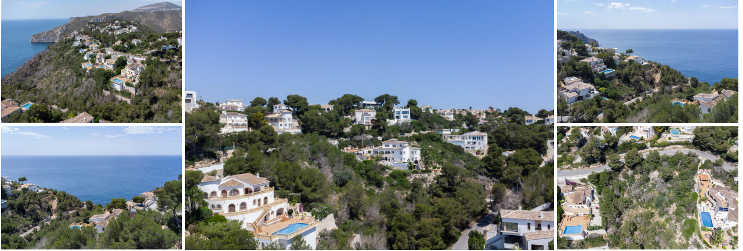
2 adjacent plots with sea views for sale in Granadella, Jávea

These 2 plots are located in the quiet urbanisation Costa Nova, just 200 m from the coastline and less than a km from the idyllic beach of Granadella. The plots have an eastern orientation and can also be purchased separately. Plot 1 has an area of 1378 m 2 and can be purchased for 515,000 euros. Plot 2 has an area of 2507 m 2 and can be purchased for 930,600 euros.