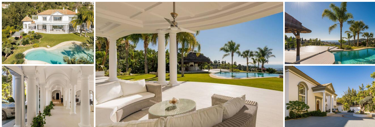
Exclusive Villa for Sale in La Zagaleta, Benahavís

Set in the prestigious La Zagaleta community in Benahavís, this refined villa offers complete privacy, sweeping Mediterranean and mountain views, and a lifestyle of unparalleled comfort and sophistication. Fully renovated in 2022 by a respected construction firm, the estate balances classic Andalusian charm with modern luxury and convenience in one of the Mediterranean's most desirable gated communities.