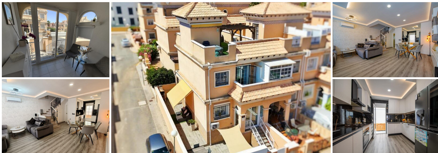
Beautifully Renovated 3-Bedroom Corner Townhouse with Solarium & Jacuzzi – Fully Furnished

This recently renovated 3-bedroom, 2-bathroom corner townhouse offers the perfect blend of comfort, style, and convenience. Set in a well-maintained community with a communal pool, the home is move-in ready and sold fully furnished – ideal for year-round living or a hassle-free holiday retreat.