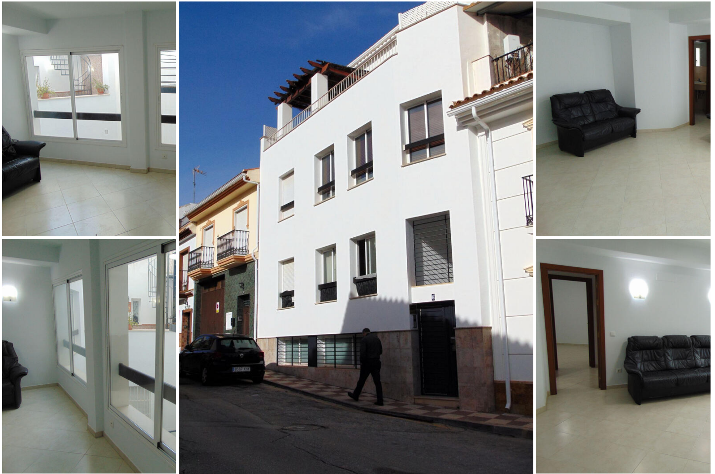
Middle Floor Apartment, Alhaurín el Grande, 3 Bedrooms, 2 Bathrooms, Built 116 m 2 .