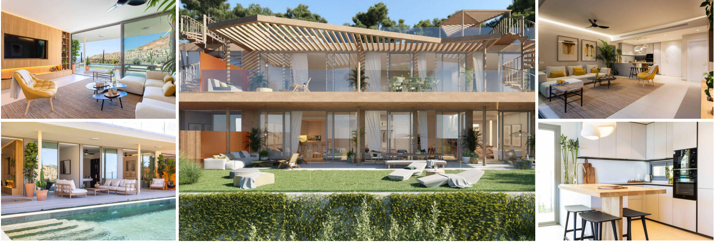
Modern Apartment with Soothing Views - Mijas

A peaceful haven between the sea and nature, with magnificent views of the valley and its Mediterranean vegetation. This ground-floor apartment offers the perfect blend of serenity and modernity, all just 10 minutes from the beach. Ideally located near shops and services, this unique property invites you to experience a relaxed and comfortable lifestyle.