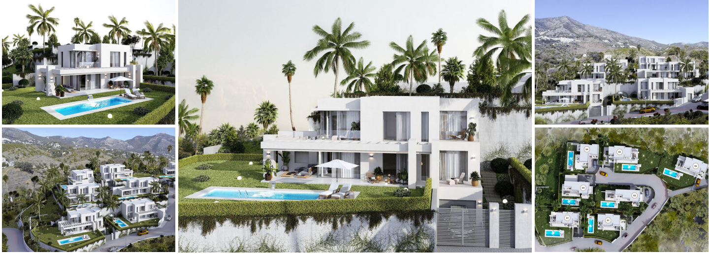
MIJAS ... OFF PLAN VILLAS ... 4 Bedroom, 4 Bathroom

FREE Notary fees exclusively when you purchase a new property with MarBanús Estates