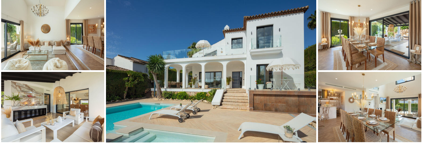
NUEVA ANDALUCIA ... 4 Bedroom Villa

FREE Notary fees exclusively when you purchase a new property with MarBanús Estates