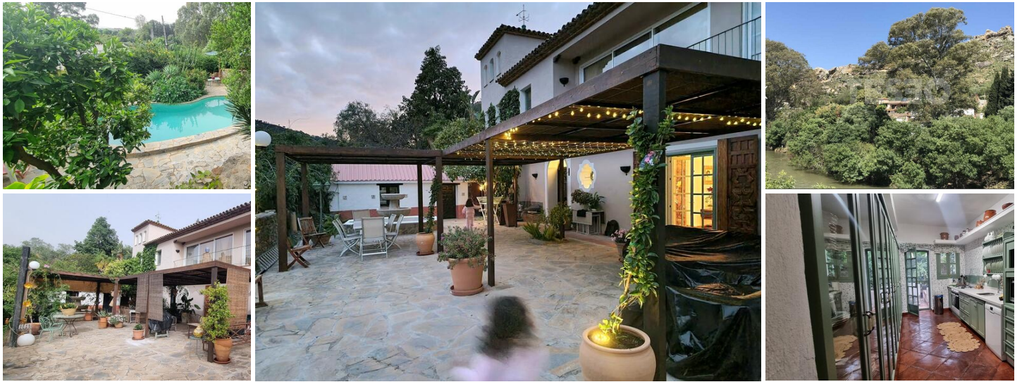
Exquisite Andalusian Retreat with Guest Cottage and Staff Accommodation

Nestled near the meandering Hozgarganta River and the enchanting "Pueblo Blanco" of Jimena de la Frontera, discover an extraordinary hacienda-style estate. This meticulously refurbished property, crafted by a renowned American architect in the early eighties, boasts unparalleled elegance and rural allure.