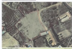
IMAGEN AEREA: EMPLAZAMIENTO PARCELAS