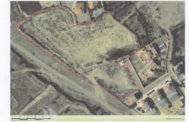
IMAGEN AEREA: EMPLAZAMIENTO PARCELAS