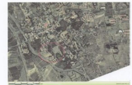
IMAGEN AEREA: SITUACION DE DETALLE