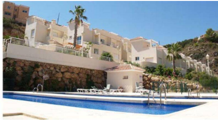
RESIDENCIAL LA ATALAYA 23 VIVIENDAS ADOSADAS CON GARAJES, ZONAS COMUNES Y PISCINAS COMUNITARIAS. PROMOTORA: EL PINAR DE BEDAR, S.A.