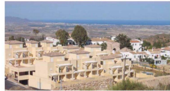
RESIDENCIAL LA FUENTE 4 VIVIENDAS ADOSADAS CON GARAJE, ZONAS COMUNES Y PISCINA COMUNITARIA. CERCA DEL PASEO DE BEDAR S.L.