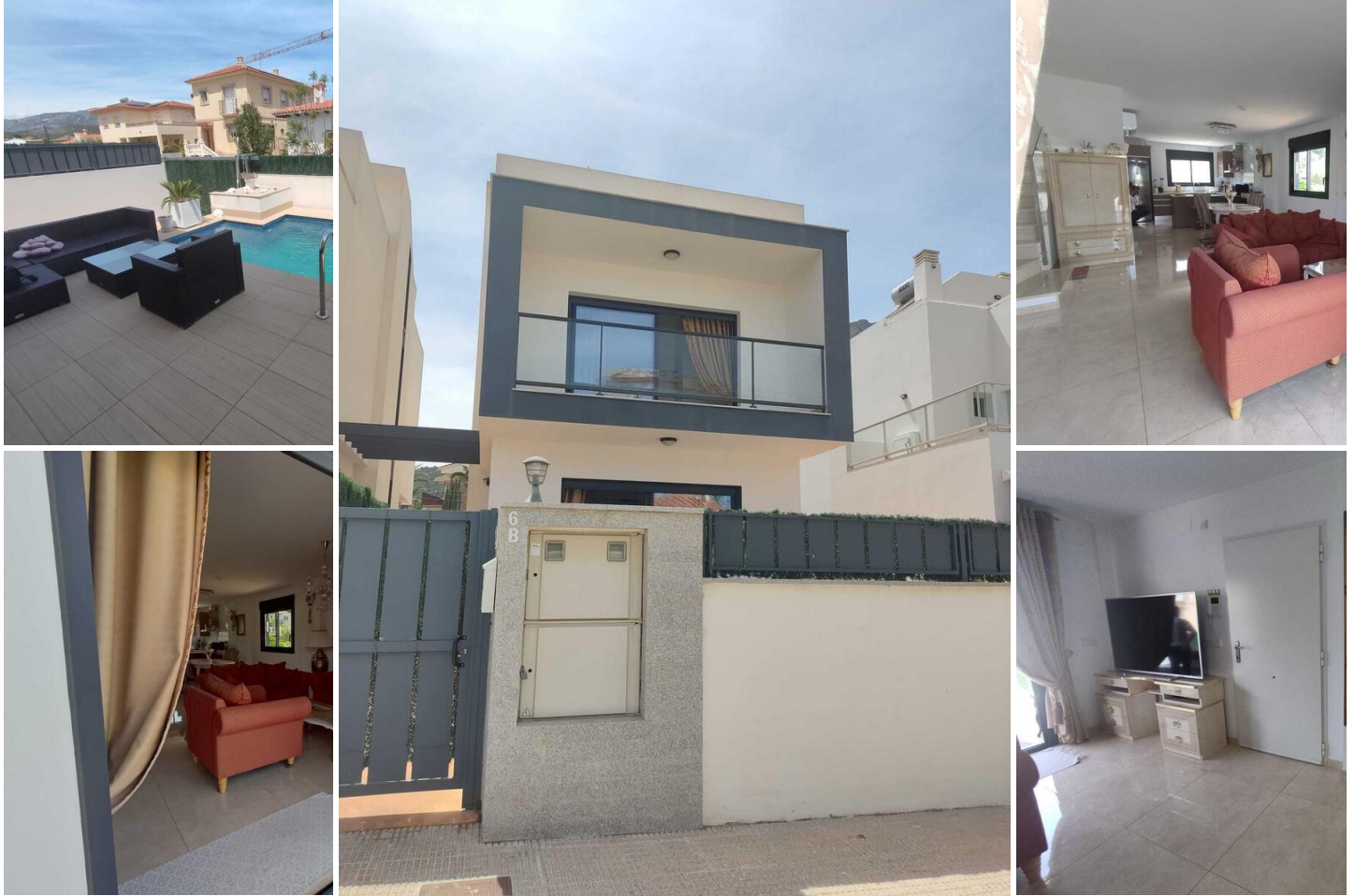
New villa in Polop.

Modern villa build in 2019 and has a private garden with pool, parking space and a BBQ area.