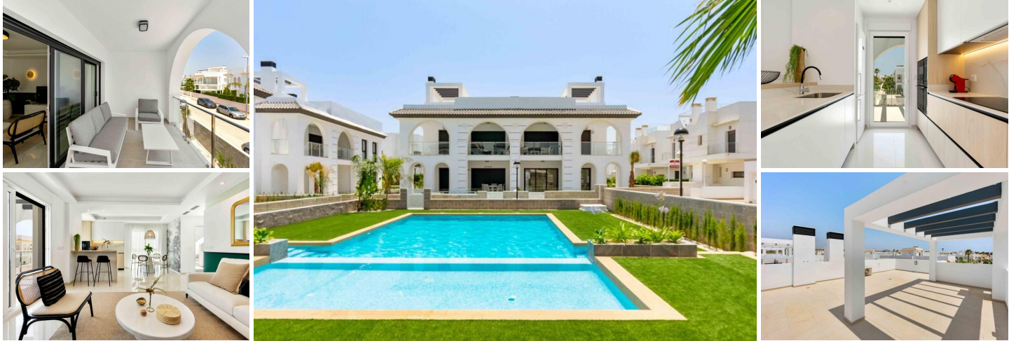
Luxury Penthouse with Private Solarium in Ciudad Quesada – Exclusive Living on the Costa Blanca

Discover this stunning penthouse for sale in the highly sought-after area of Doña Pepa in Ciudad Quesada, offering a perfect blend of modern design, comfort, and Mediterranean lifestyle. Situated within a secure, gated residential complex, this property is ideal for those seeking privacy, quality, and convenience on the Costa Blanca.