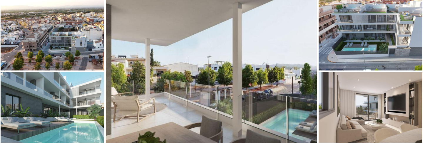
New Build Apartments in Benijofar with a central location