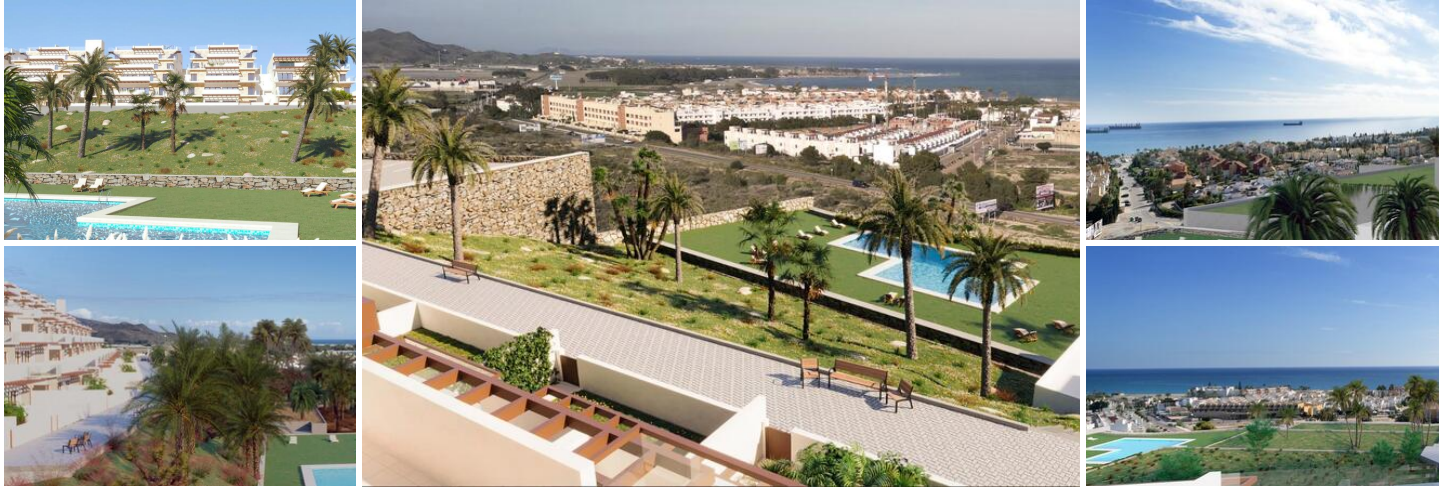
New Build Apartments with Sea Views in Vera Playa, Almería

Discover this exceptional new residential development in Vera Playa, offering 27 modern apartments in its first phase. Designed to combine comfort, functionality, and spectacular Mediterranean views, this project is ideal for those seeking a home on the Costa de Almería with style and convenience.