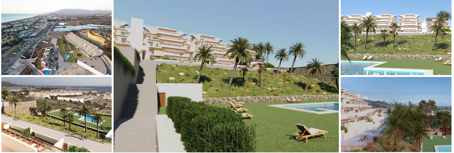
New Build Apartments with Sea Views in Vera Playa, Almería

Discover this exceptional new residential development in Vera Playa, offering 27 modern apartments in its first phase. Designed to combine comfort, functionality, and spectacular Mediterranean views, this project is ideal for those seeking a home on the Costa de Almería with style and convenience.