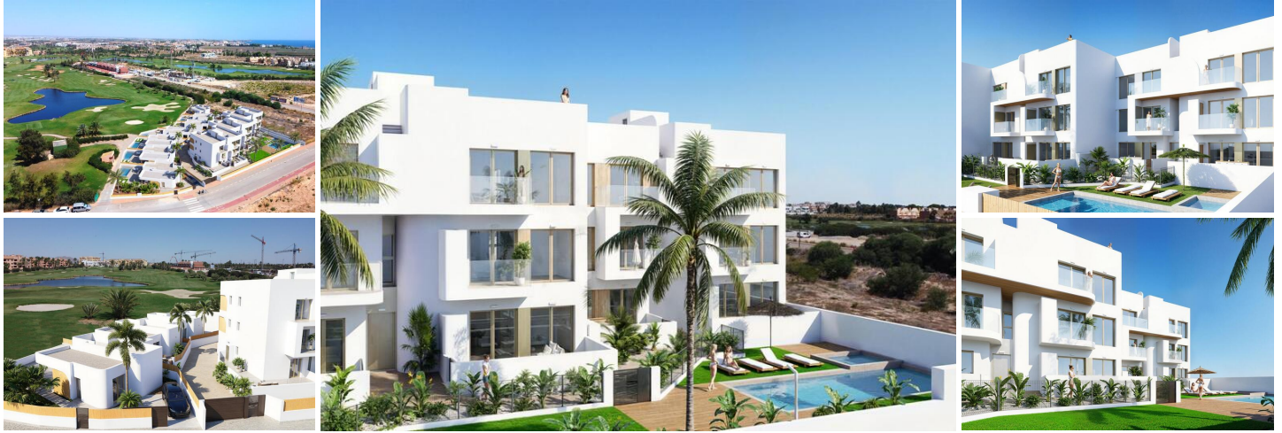
New Build Residential Complex in Los Alcázares on the Frontline of Serena Golf