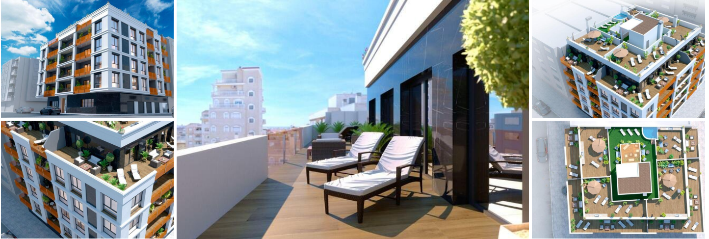
Modern New Build Apartments in Central Torrevieja Costa Blanca