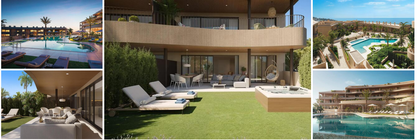
New Build Luxury Residences in El Higuerón, Costa del Sol