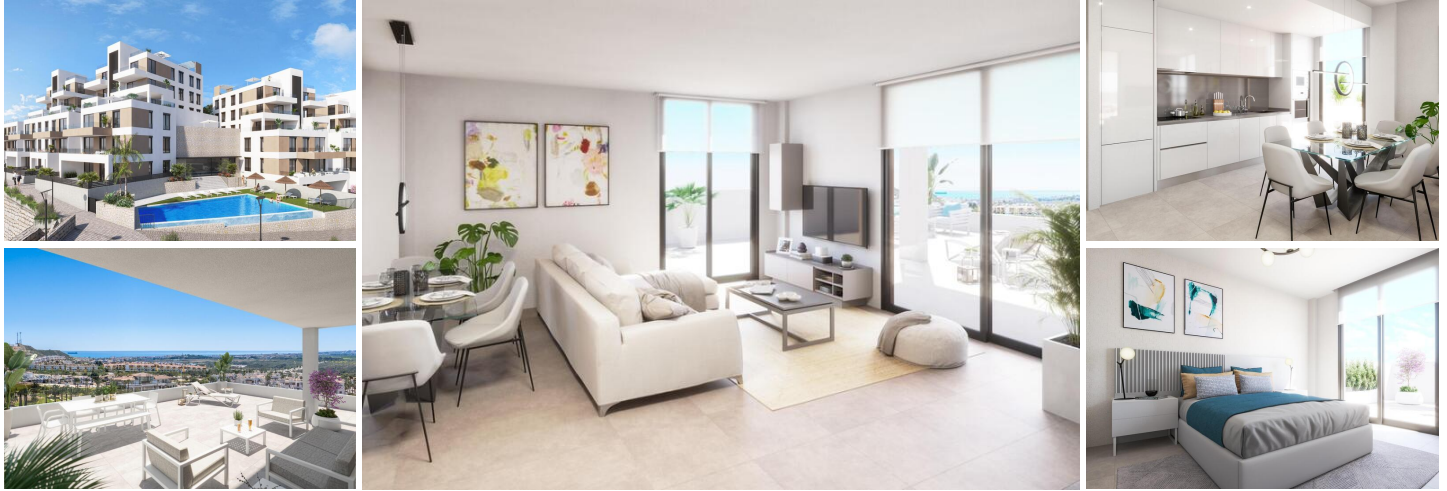
New Build Apartments in Vera Playa, Almería – Modern Homes Near the Sea