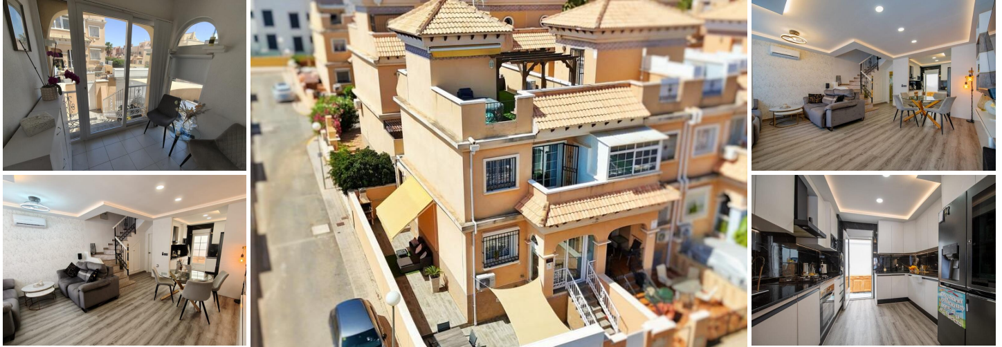
Beautifully Renovated 3-Bedroom Corner Townhouse with Solarium & Jacuzzi – Fully Furnished

This recently renovated 3-bedroom, 2-bathroom corner townhouse offers the perfect blend of comfort, style, and convenience. Set in a well-maintained community with a communal pool, the home is move-in ready and sold fully furnished – ideal for year-round living or a hassle-free holiday retreat.