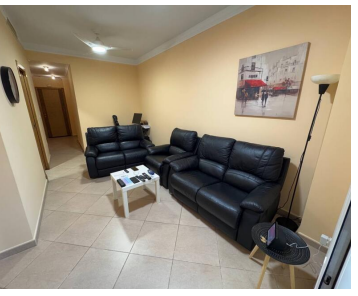
Beautiful 2-Bedroom Apartment - Fully Furnished & Earn; Move-In Ready & #13; & #13;

Discover this beautifully presented 2-bedroom, 2-bathroom apartment offering 78m² of stylish, low-maintenance living in excellent condition. Perfectly positioned just 20 minutes from the beach and with immediate access to local amenities, this home is ideal as a holiday getaway, investment property, or permanent residence with a beautiful communal pool on the roof.