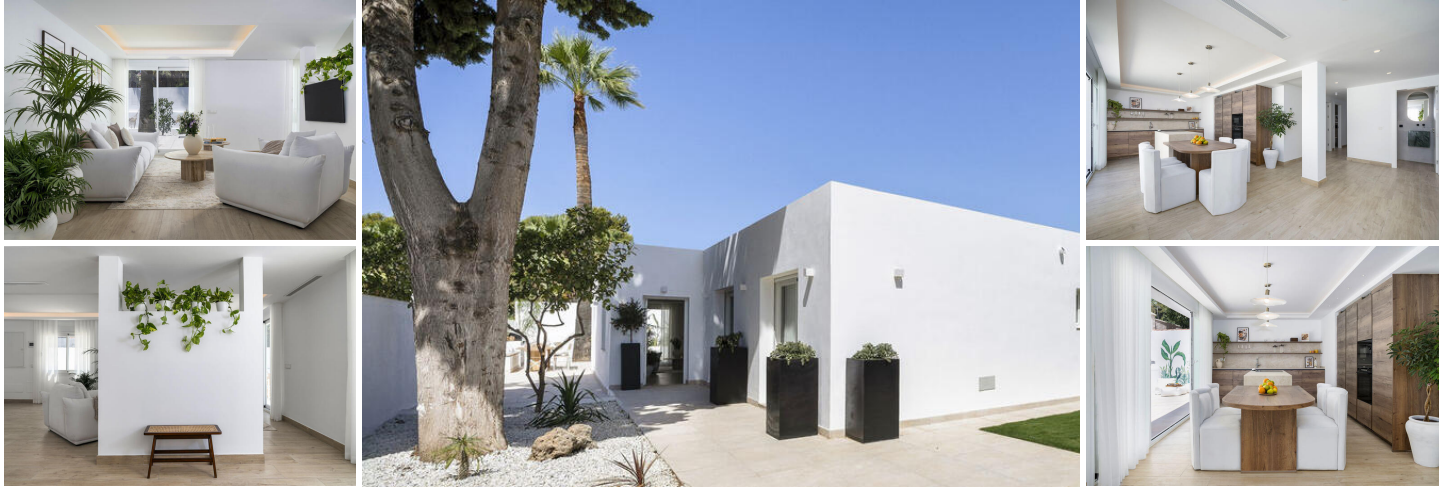
MARBELLA, NUEVA ANDALUCIA ... 4 Bedoom, 3 Bathroom Villa

A completely renovated, single-floor villa offering the epitome of modern mediterranean-style living in the heart of Nueva Andalucia. This 4-bedroom, 3-bathroom gem has just been renovated in 2023 with high-quality materials like wood, ceramic, and marble, and comes furnished with custom-made, high-quality pieces. Appliances are from the trusted brand, Bosch.