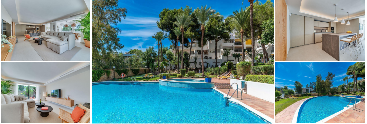
ATALAYA ... 3 Bedroom, 2 Bathroom apartment

FREE Notary fees exclusively when you purchase a new property with MarBanús Estates