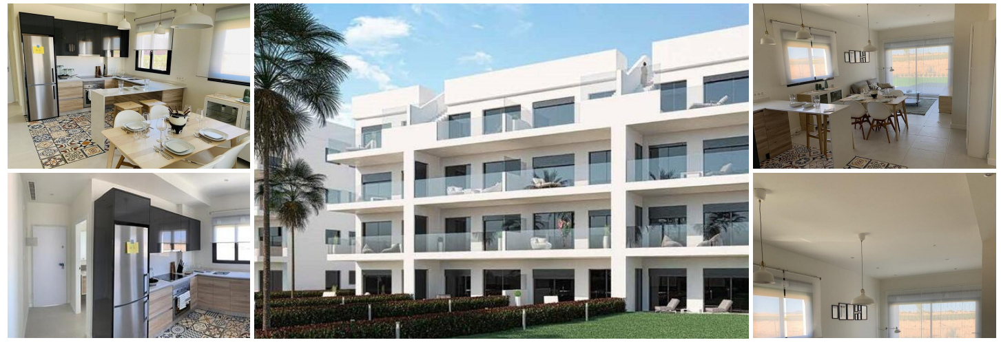
NEW APARTMENTS IN CONDADO DE ALHAMA GOLF COURSE

New two-bedroom, two-bathroom apartments with frontline golf views of ALHAMA SIGNATURE GOLF, a fabulous 18-hole golf course designed by Jack Nicklaus.