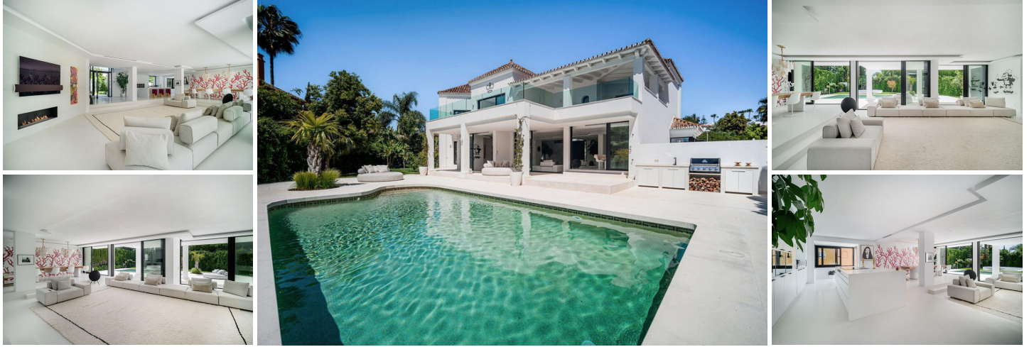
NUEVA ANDALUCIA .... VILLA 4 Bedrooms, 5 Bathrooms

FREE Notary fees exclusively when you purchase a new property with MarBanús Estates