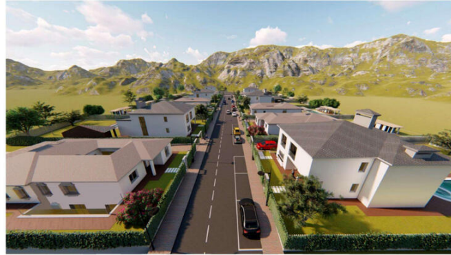
Ejemplo de barrio, zona este