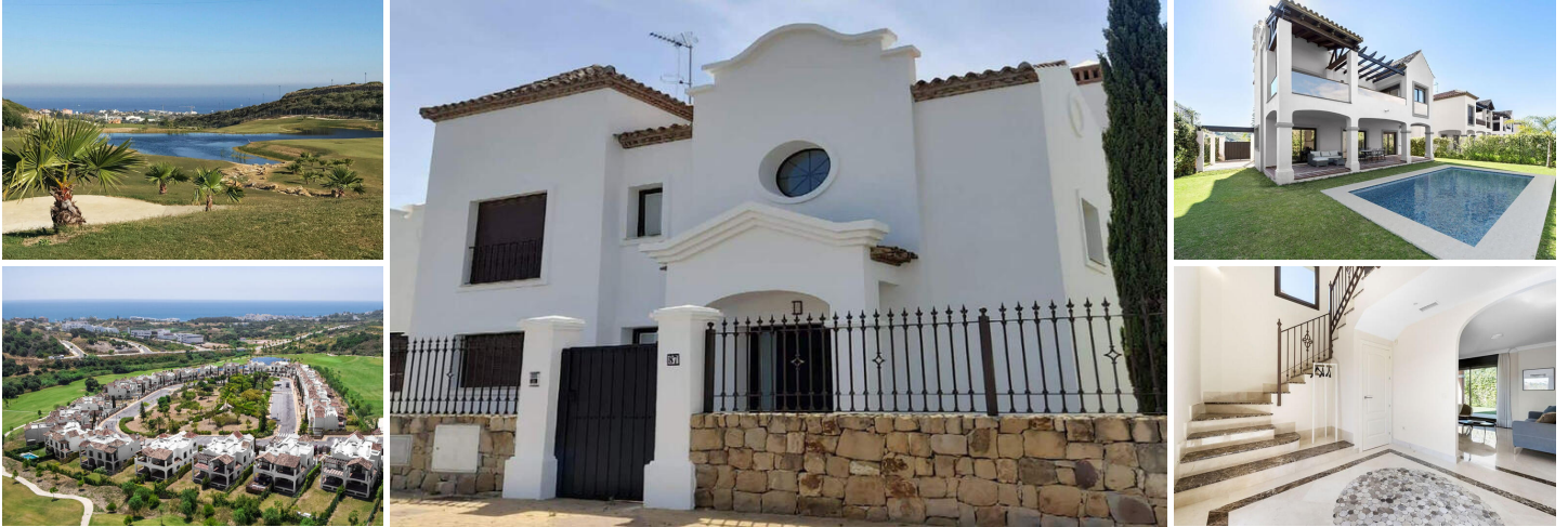
Villa MAJESTY - First Line Golf - West Estepona

This detached villa, surrounded by golf courses, is ideal for nature and golf enthusiasts, as it is located just 5 minutes from the beach. Additionally, it is near major shopping areas and the hospital and is a 10-minute drive from the center of Estepona.