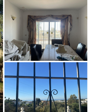
Investment Opportunity Villa in need of total renovation

The villa is located in Atalaya and has amazing sea views, from the living area, sat on a fantastic plot of 1412 m2. The Villa is in need of total renovation inside and out! A fantastic opportunity for any investor. The Villa currently has living dining area with open fireplace, leading out to a South Facing terrace to appreciate the amazing views. On the mid lower level is a double bedroom with En Suite, and on the garden level are a further 2 bedrooms very large, sharing a family bathroom with plenty of storage. Both bedrooms lead out onto the garden. The garden area is a great size very private with private swimming pool. Parking space for at least 2 cars, with a garage that has been turned into a self contained unit.