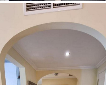
SHORT TERM RENTAL

Contemporary 2 bedroom, 2 bathroom apartment available for holiday rentals on the Golden Mile.